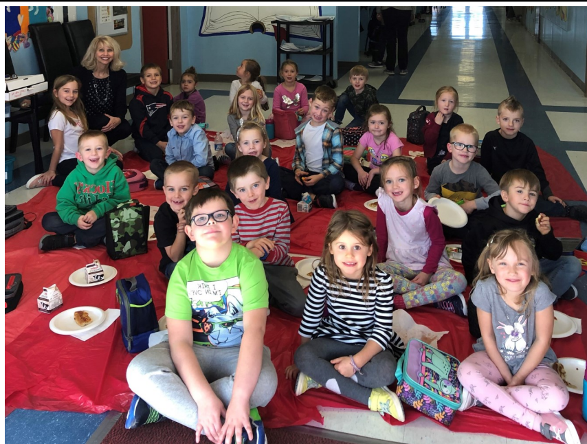
Lunch with the Principal

There is no school Friday, November 8th for Professional Learning, Monday, November 11th for Remembrance Day, and Friday, November 22nd for parent-teacher.